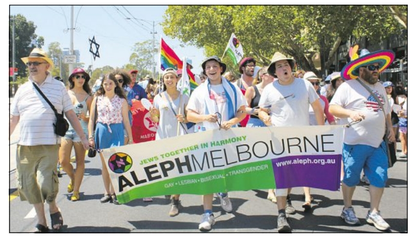
Aleph members taking part in Melbourne's 2014 Pride parade.

"The ideology of same-sex marriage clashes with the traditional in dehumanising stereotypes and Abrahamic concept of marriage